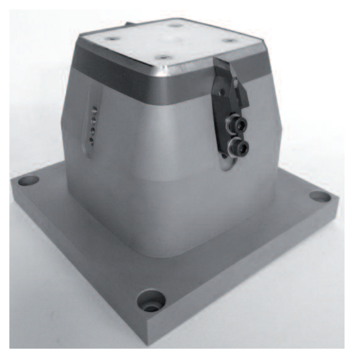
Counter pressure dies are supplied with a counter pressure matrix pad