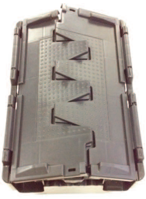
Packing made from recycled polypropylene.